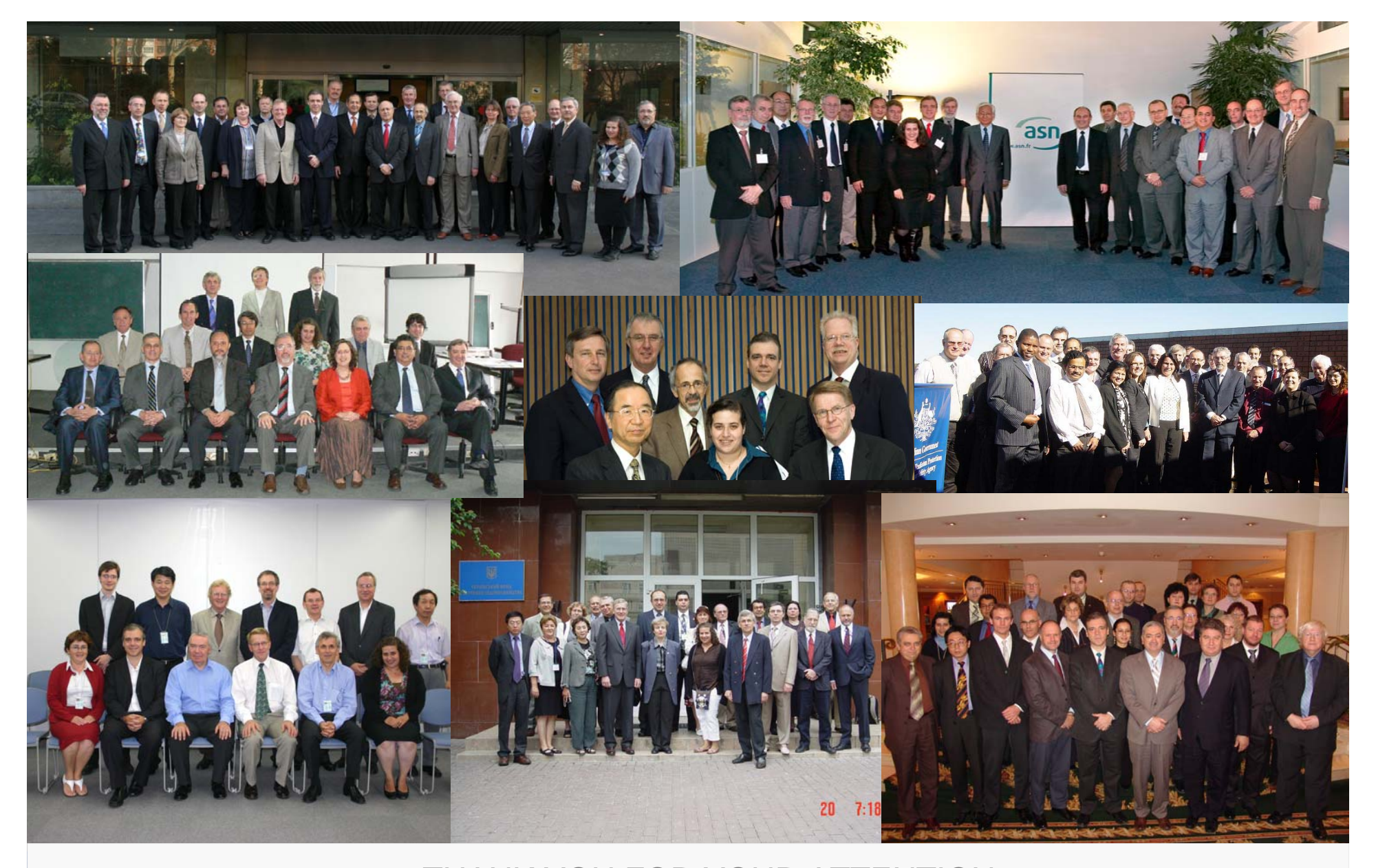
....THANK YOU FOR YOUR ATTENTION